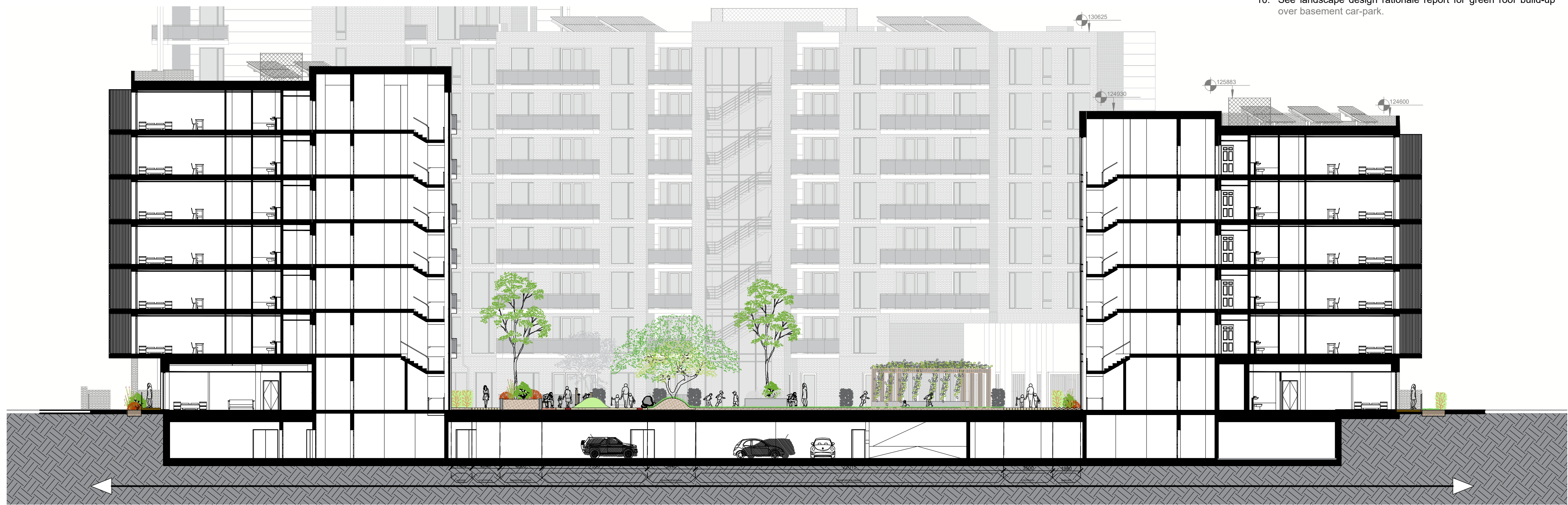
SECTION AA - SC.1/200